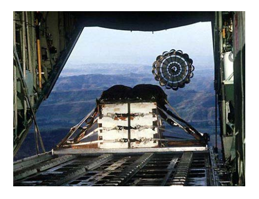
Type V Platform

21. The increasing emphasis on precision is driven by some User requirements to be able to insert loads from altitude, probably in concert with parachutists with the certainty that the load will land close to the intended impact point. Delivery of equipment and stores from high altitude provides the option for stand-off delivery which can add a degree of operational security to the intended impact point. Such high altitude delivery can also reduce the threat to the delivery aircraft. Work is on-going in the UK to formalise a Statement of User Requirement to fill this capability gap. However, there has been considerable discussion about whether the key requirement driver is to enable insertion of a forces or their subsequent resupply. UK thinking is probably leaning to the former. While there remains considerable industry activity to develop potential airdrop systems, the UK continues to have some doubts about the technical maturity of the systems on offer. For the UK to consider taking a programme forward we would wish to see solutions available with a Technology Readiness Level<sup>5</sup> of at least 5-6 and in view of the UK