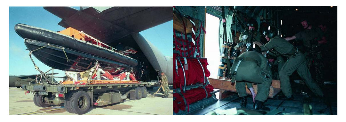
Figure 4: PURIBAD Installation and Despatch - Board despatch from a C130K.