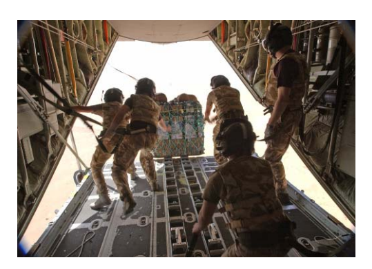
Figure 7: 47 Air Despatch Squadron soldiers on operations in Iraq – Op TELIC 2004.