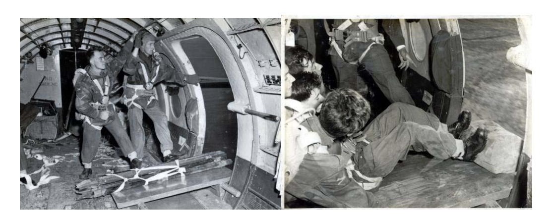
Figure 1: Air Despatchers operating and training during the Second World War.

3. By the spring of 1944, the demand for aerial supply to support the Special Operations Executive (SOE) and local resistance operations in occupied countries became pressing. Concurrently, it was realised that there would be a heavy demand on this capability to support D-Day and subsequent operations. Consequently, the Air Despatch Group was formed. At its zenith the Group comprised 5000 personnel and approximately 1500 vehicles. The early operations of the Group included D-Day, the Falaise Gap and the Relief of Paris. These were a prelude to the huge and costly effort made to re-supply the 1<sup>st</sup> Airborne