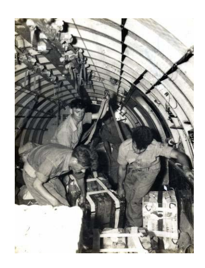
Figure 2: Air Despatch soldiers operating in support of the Malayan Emergency.

4. In post-war years, air supply has been called upon to meet many military and civil contingencies. It played an auspicious part in the successful campaign against communist terrorists in the Malayan emergency, which started in 1948, providing the vital lifeline without which patrols could not have penetrated the jungle hideouts of the insurgents. Air Despatch has also supported operations in East Africa, Suez, Brunei, Aden, Borneo, Oman, Northern Ireland, Rhodesia, The Falklands and Northern Iraq. During Operation CORPORATE (Falkland Islands) in 1982 new techniques were developed to meet the requirement to deliver stores and equipment to ships at sea.