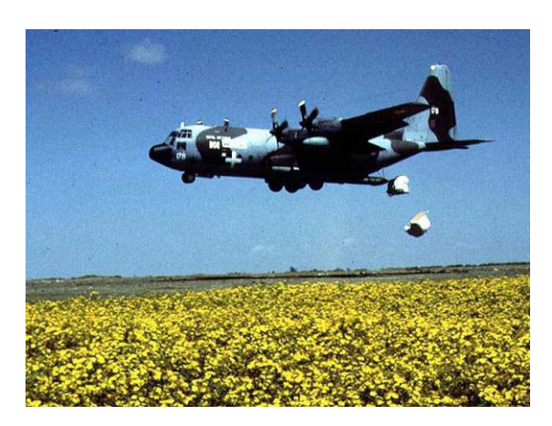
Figure 6: Support to Humanitarian Operation in Ethiopia - Op BUSHEL 1984.

15. Since 2001, the UK's Air Despatch Squadron has been despatching equipment and stores by air in Iraq, Afghanistan and the Falkland Islands. Additionally, a small detachment from the Squadron recently deployed to Pakistan where they were prepared to support the earthquake disaster through delivery of humanitarian aid.